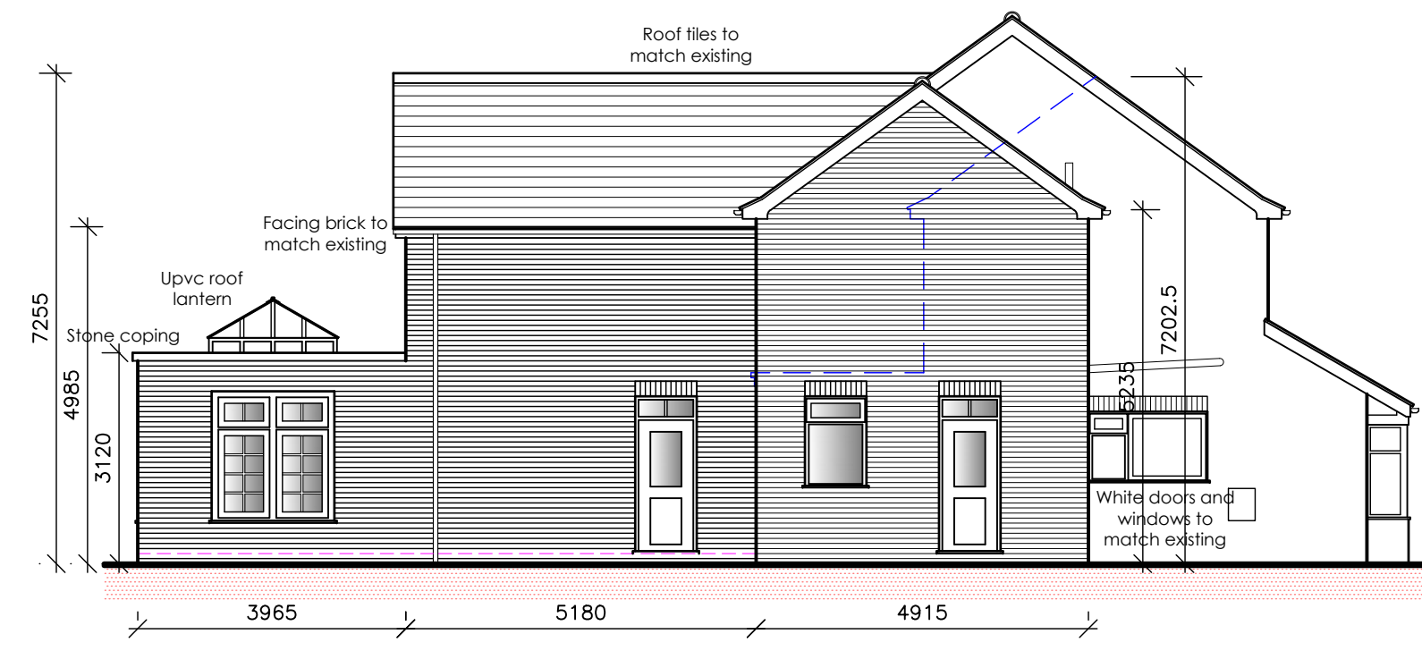
SIDE (EAST) ELEVATION SCALE 1:100