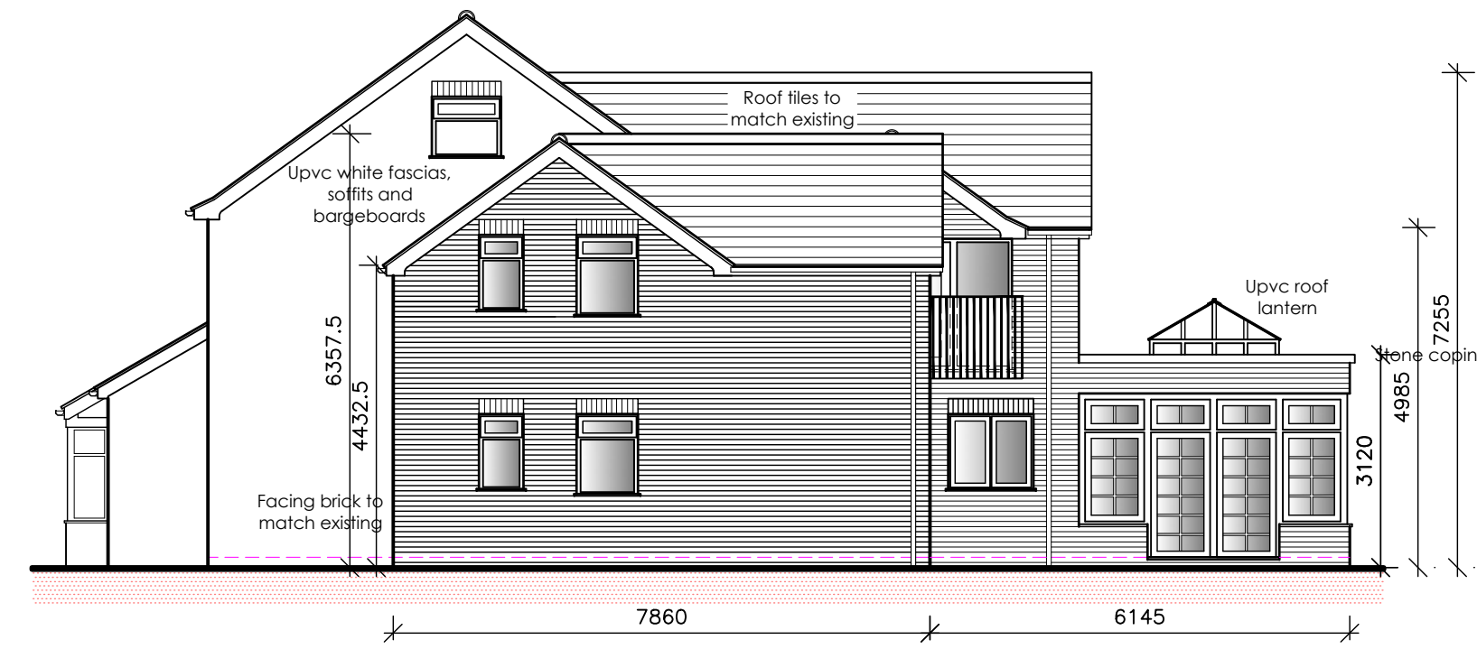
SIDE (WEST) ELEVATION SCALE 1:100